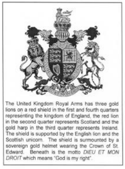
Royal Arms of the UK<sup>38</sup>

supporters are the English lion and the Scottish unicorn and the shield is surmounted by St Edward's Crown. Around the base of the shield are the shamrock, thistle and rose, the floral emblems of Ireland, Scotland and England, respectively.